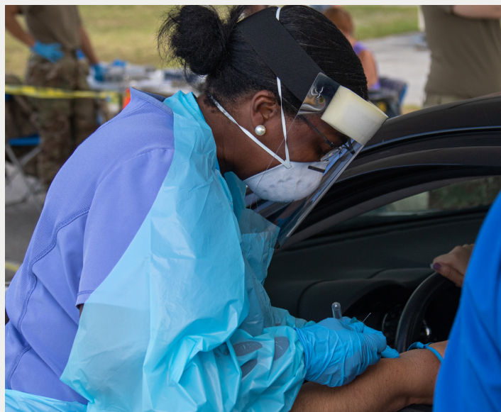
The National Guard, bit.ly/36cSJEa